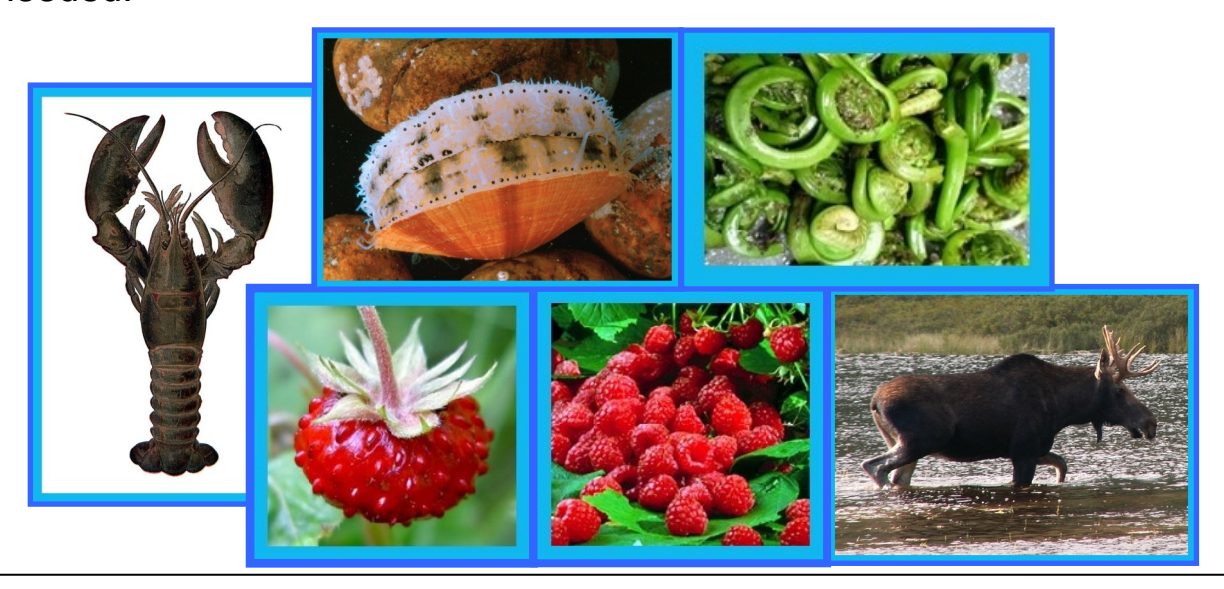
More information can be found on the FNFNES website: www.fnfnes.ca

If you have any questions about these results or the project itself, please contact: